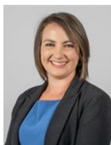
Senator Tracey Vallois